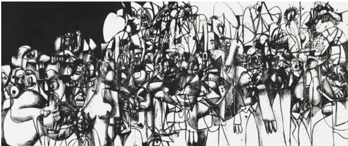
George Condo, The Investigation, 2017. Oil and pigment stick on linen, 100 × 240 inches. (Triptych, three unattached panels, each 100 × 80 inches)

Rail: I wrote about Cezanne and Pissarro, who were close buddies, and Johns and Rauschenberg who were more than buddies. Sometimes I thought, "Wow, there's actually a correlation between Pissarro and Rauschenberg, and Pissarro loved dirt." So one day I turned to Bob [Rauschenberg] and said, "Do you know this painting in Chicago, this kind of big swath of land and pure dirt? Were you ever influenced by Pissarro?" And he looked at me—he may have had a glass or two—and he said, "No, I don't think so. But you know, Pissarro was influenced by me." [Laughter].