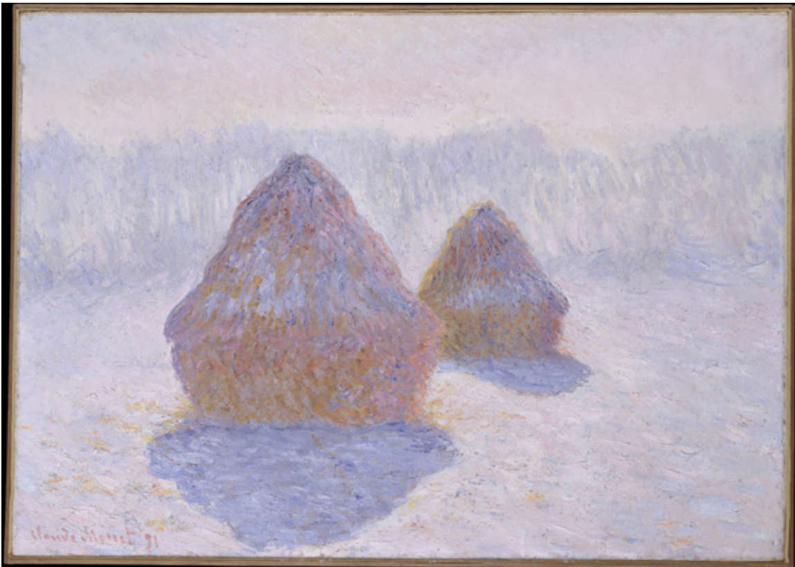
Claude Monet, Haystacks (Effect of Snow and Sun) , 1891. Oil on canvas, 25 3/4 × 36 1/4 inches. Collection of the Metropolitan Museum of Art, H. O. Havemeyer Collection, Bequest of Mrs. H. O. Havemeyer, 1929.

Rail: When Monet was asked why he painted cathedral walls so many times—thirty times—he said, "I'm not interested in the cathedral; I'm interested in the air, the envelope that separates me from the cathedral. That's what I was painting."