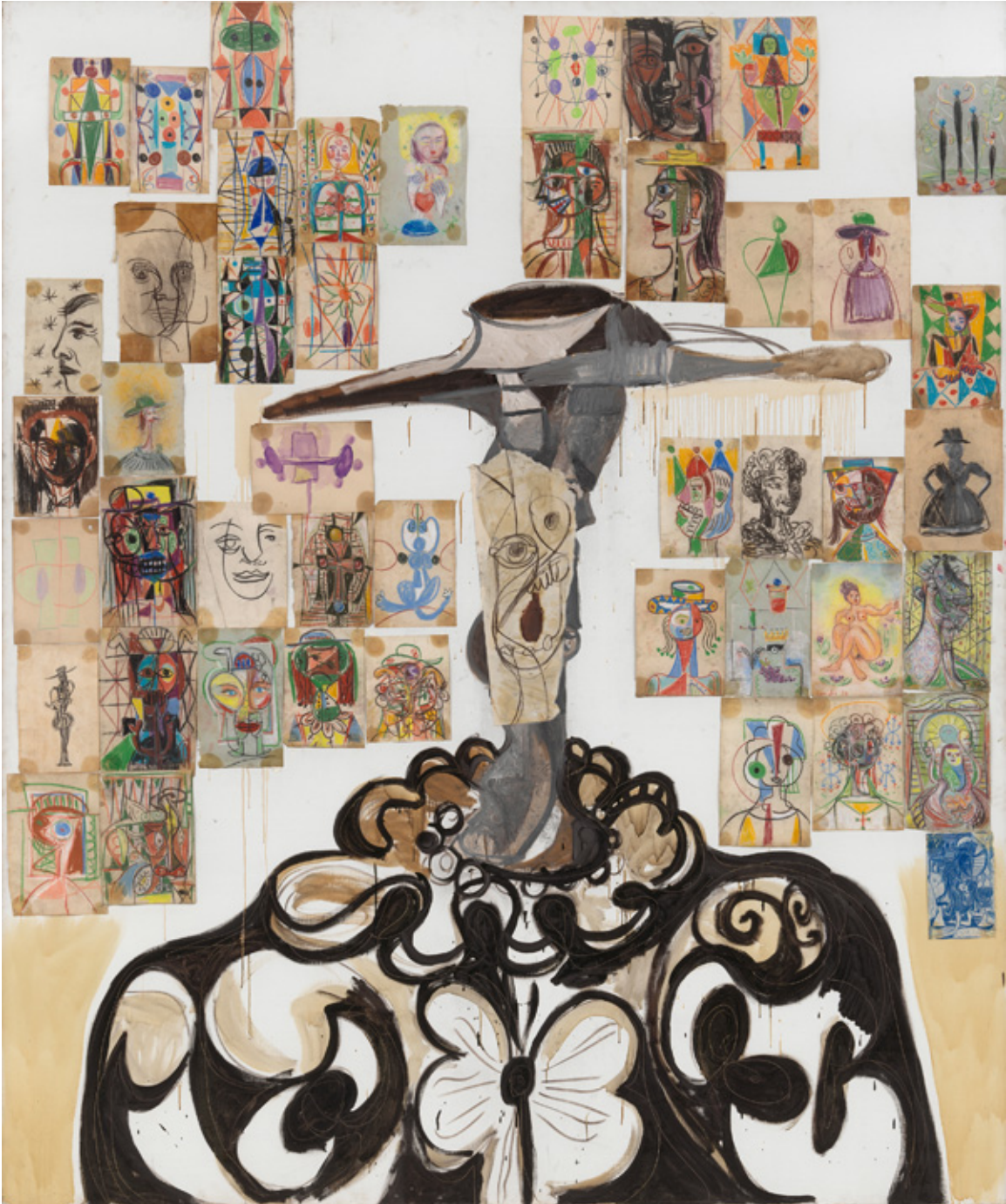
George Condo, Spanish Head Composition , 1988. Oil and collage on paper mounted on canvas, 118 × 98 in. The Museum of Modern Art, New York. Given anonymously, 2013.

Condo: I think it's a pleasure to play with people's heads, and say, listen: they're going to come in and see everything they know, and it's not going to be what they want it to be because it's all used for the wrong reasons, and then it adds up, and they have to see what it is used for.