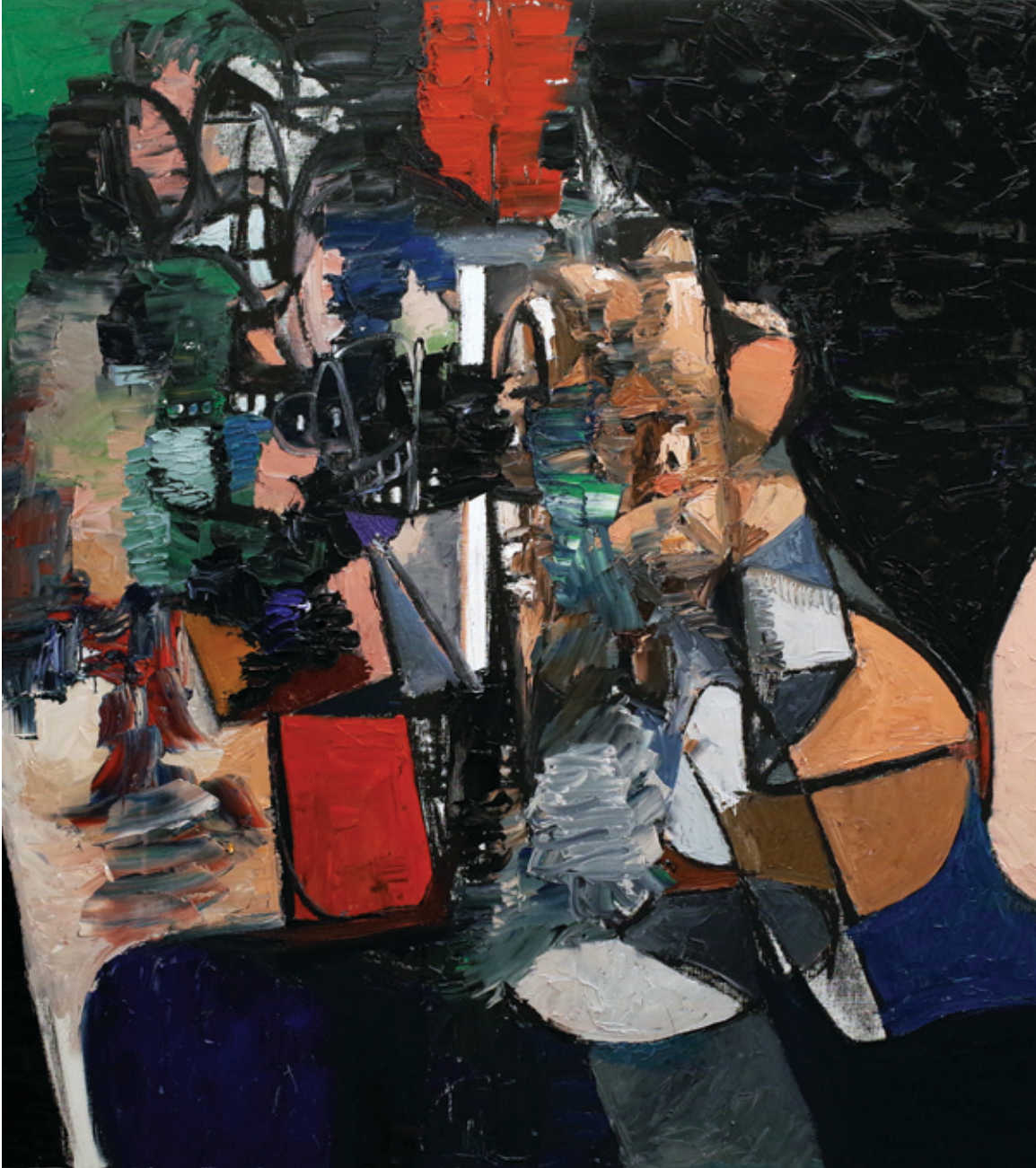
George Condo, The Hill, 2015. Oil and pigment stick on linen 62 × 57 inches

When I was contemporary with Keith [Haring] and with Jean-Michel [Basquiat]—these guys were my two best friends—we spent so much time talking about art. The two of them made sort of similar art, but Jean-Michel did not like to think that he was doing anything like anyone else. Keith had an overwhelming admiration for Jean-Michel. When Jean-Michel did the crown, Keith did the baby. I did the old masters, and so I was not a threat. I had my own separate discussion. But it was a discussion that neither one of those two artists could have possibly incorporated into their works at that time because they simply did not come from the kind of background that I come from.