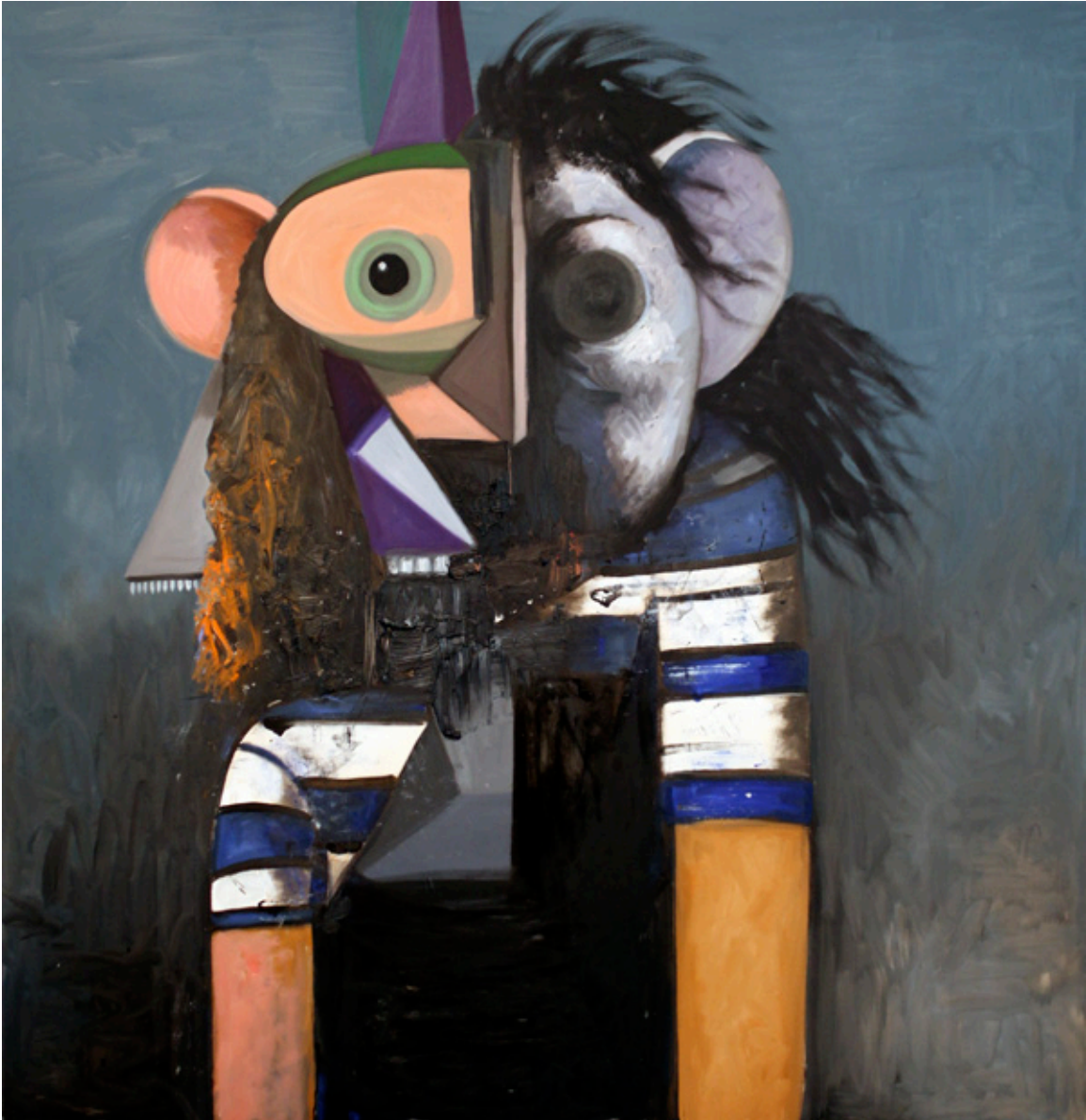
George Condo, Paralytic Robot, 2014. Oil on linen, 67 × 65 inches.