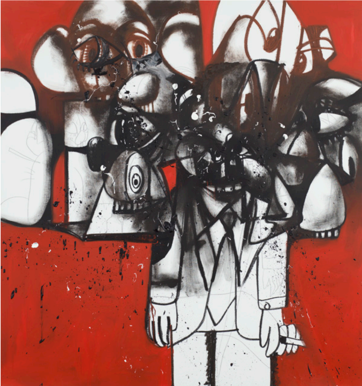
George Condo, Last Man Standing , 2017. Oil, graphite and pigment stick on linen, 80 × 75 inches. Courtesy the artist and Skarstedt Gallery, New York.

Condo: But if you think about it, a guy like Arnold Schoenberg, he comes along after the point of the great string quartets of Beethoven had been performed, and then suddenly everything softens out and turns into Mendelssohn and Debussy. All of a sudden Schoenberg realizes that in order to stand there as a German composer next to the strength of Beethoven, he “will have to smash every single mirror in order to get there.” It’s in Schoenberg’s music: the existential absence of what he has and the presence of what has been removed is there. When there’s a schism between what it was and what it became, like in a semiotic type of discussion where you have the imitation of something, but imitation means something completely different than the thing itself that’s being imitated. And it takes on an identity of a new object even though it resembles the old emblem that it came from.