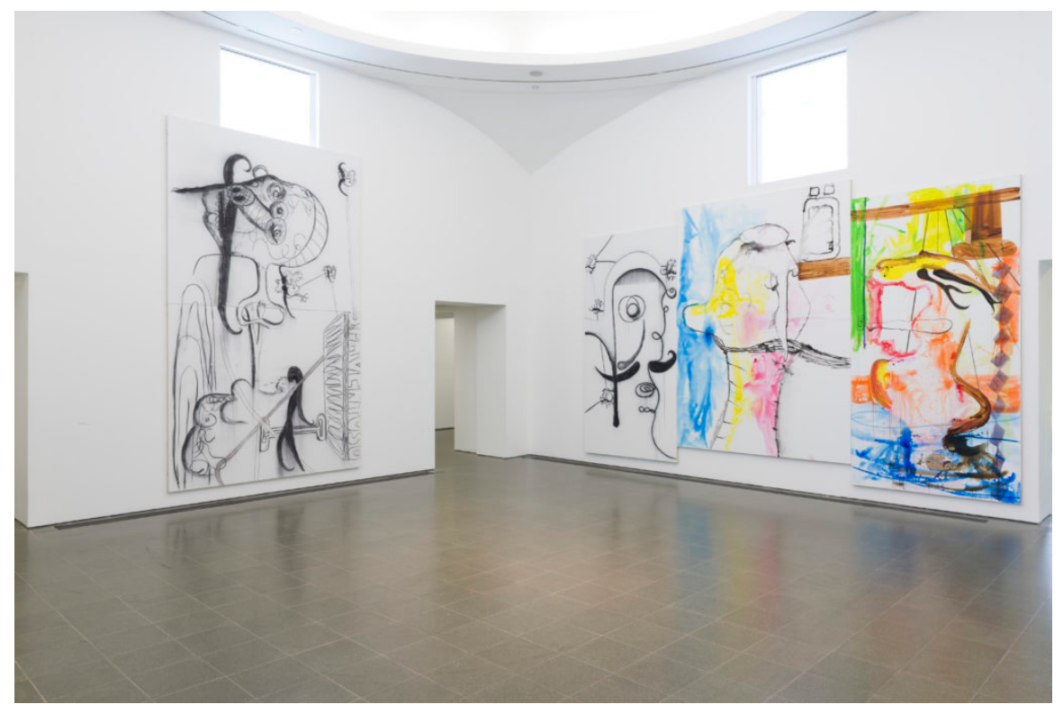
Installation view of the Albert Oehlen show at the Serpentine.

month, Skarstedt beat out David Zwirner to snag Oehlen's Selbstportrait mit Leeren Handen (1998) at Sotheby's London. That was the record-breaker, going for nearly $8 million.