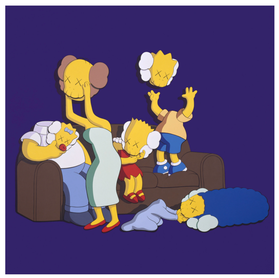
KAWS, "Untitled (Kimpsons #2)," 2004, acrylic on canvas.

Donnelly's "Simpsons" work is some of his most commercially successful and least altered from its source material, though Donnelly was not totally allergic to formalist experimentation: His "Landscape" series, made on canvas (2001), four examples of which are here, offers a single "Simpsons" character blown up and cropped so that its features resemble abstractions. They play with ideas of cool, calm Color Field painting and Hard-Edge, with its sharp, clear shapes, and especially recall Al Held's <u>Alphabet Paintings</u> of the '60s, which drew from advertising.