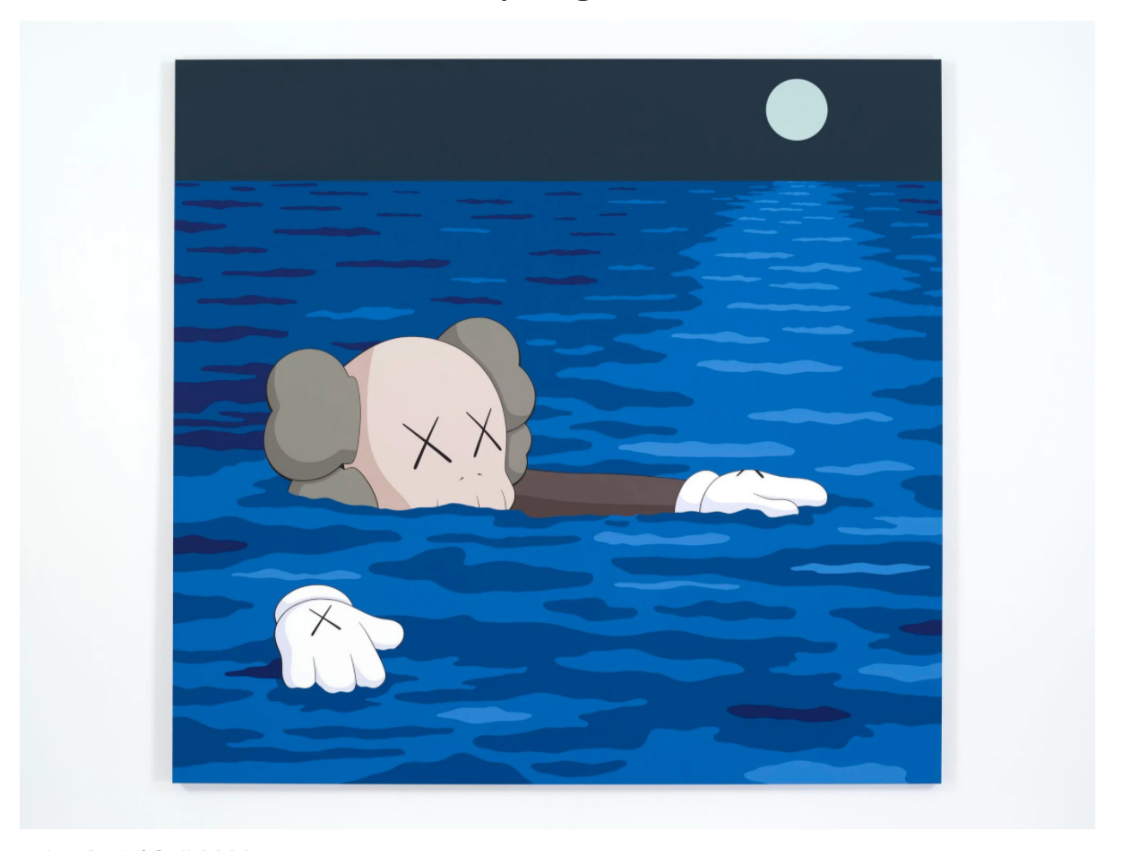
KAWS, "Tide," 2020. KAWS and Brooklyn Museum

There's also a room devoted to work made last year addressing the pandemic: "Urge," a suite of 10 roughly square canvases, disembodied hands dangerously close to touching a face; "Separated," a sculpture of a Companion figure, crumpled into a pile with its face in its hands; and "Tide," a painting of Companion adrift in a moonlit body of water, possibly drowning. The paintings are luminous, their rich pigment seeming to glow from within. But as a comment on the current moment, and its staggering loss, they feel mostly perfunctory. Their mood is morose but so is everything else.