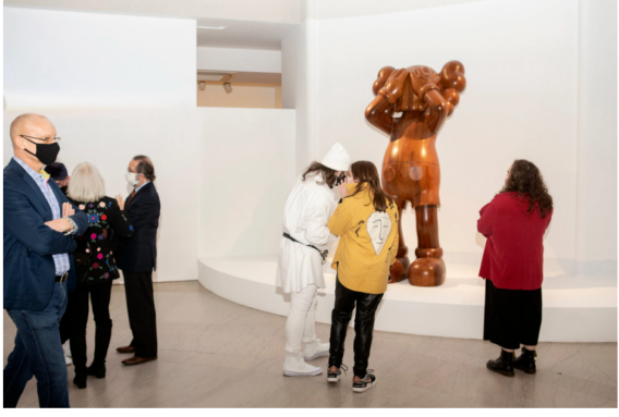
Attendees in front of the piece "At This Time." The museum's preview for the exhibition was the first of its kind since the pandemic began.