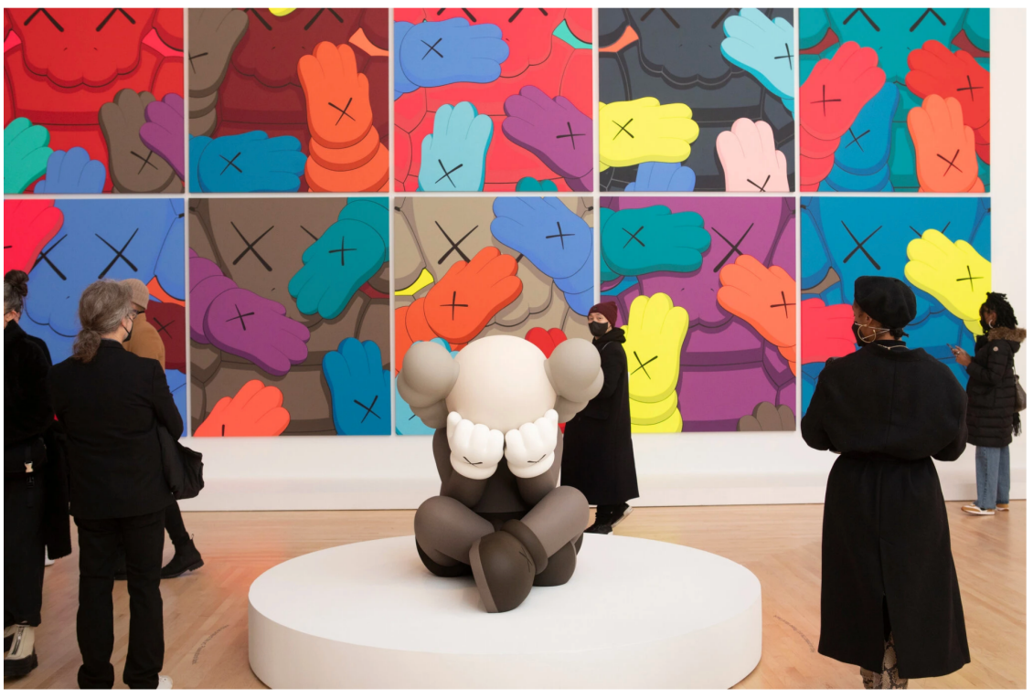
A preview of "KAWS:WHAT PARTY" at the Brooklyn Museum on Tuesday offered a room of new work by the artist Brian Donnelly related to the pandemic. The wall of images is from his "Urge" series; the despairing sculpture is titled "Separated."

The Simpsons, Snoopy and the Smurfs are all here in a survey of the artist Brian Donnelly's 25-year career.