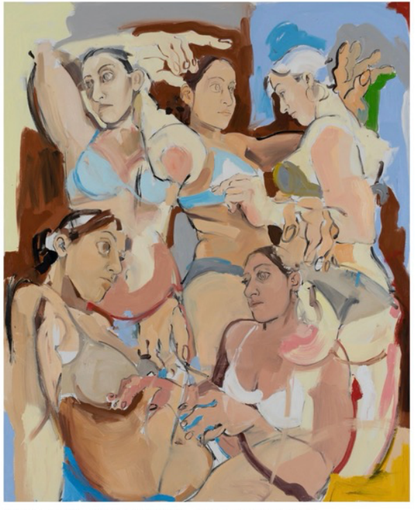
Cristina BanBan, Mujeres II, 2022. Courtesy of Skarstedt

20 East 79th Street New York NY 10075 tel. +1 212 737 2060 email. info@skarstedt.com www.skarstedt.com