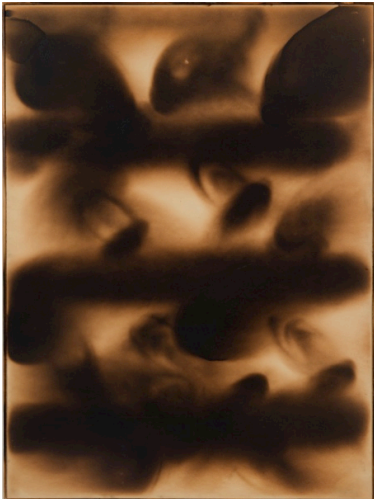
Yves Klein, "Peinture de feu sans titre" (F 5), c. 1961