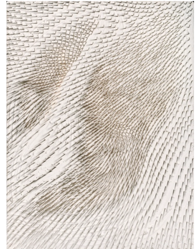
Günther Uecker, Inseln (Island) , 1964

Skarstedt is delighted to announce its forthcoming exhibition Burning, Cutting, Nailing at the London gallery this June. The exhibition explores the dual approach of destruction and creation in iconic works by modern masters including Yves Klein, Lucio Fontana and Günther Uecker.