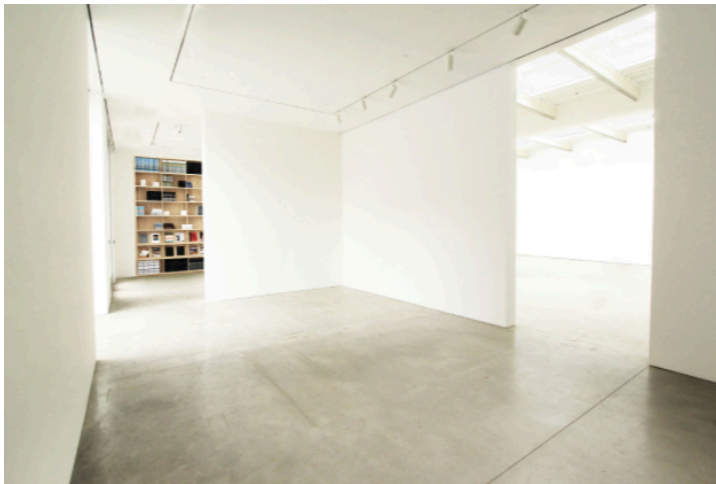
Front Gallery looking North.