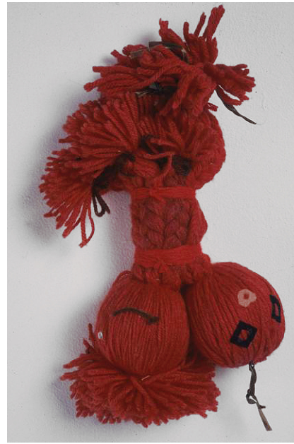
Left: Jeff Koons, Stacked , 1988, polychrome wood, 61 x 53 x 31 inches. Edition of 3 + 1 AP. Right: Mike Kelley, Manly Craft #4 , 1989, yarn animals, tied (octopus doll), 14 x 9 x 4 inches.